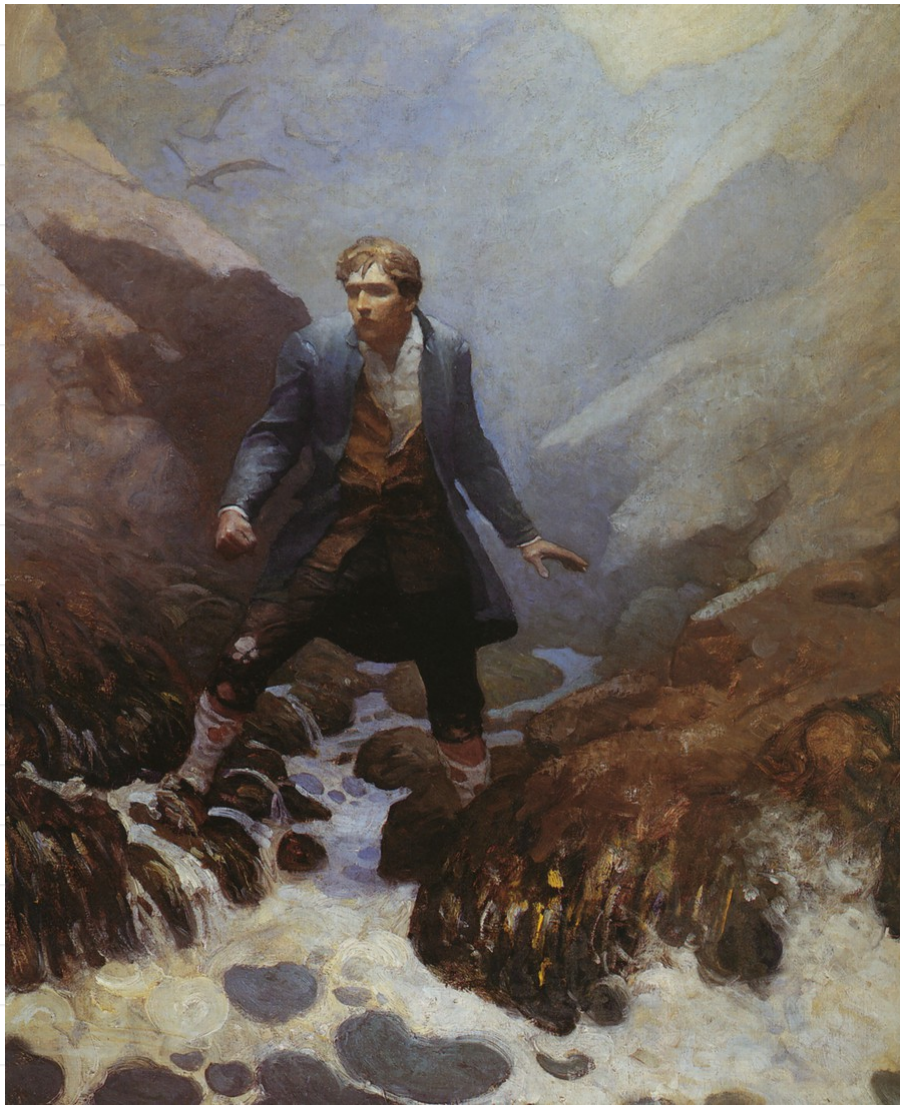
Kidnapped illustration by NC Wyeth