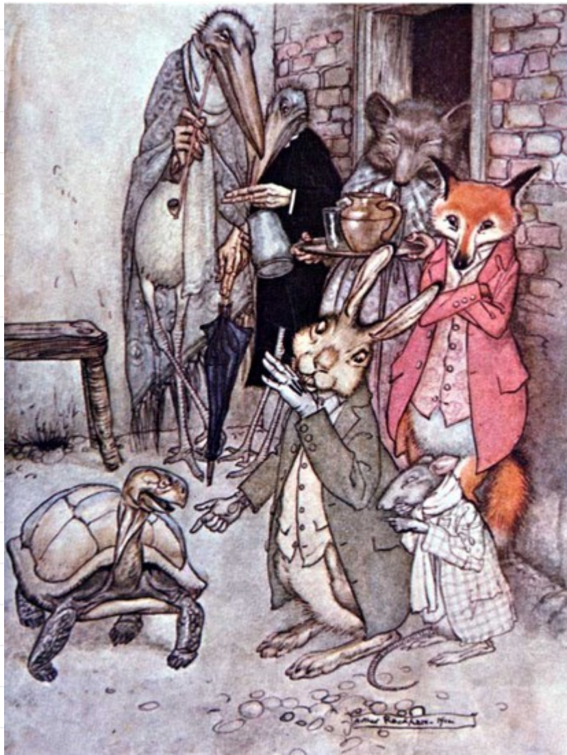
The Hare and the Tortoise illustration by Arthur Rackham