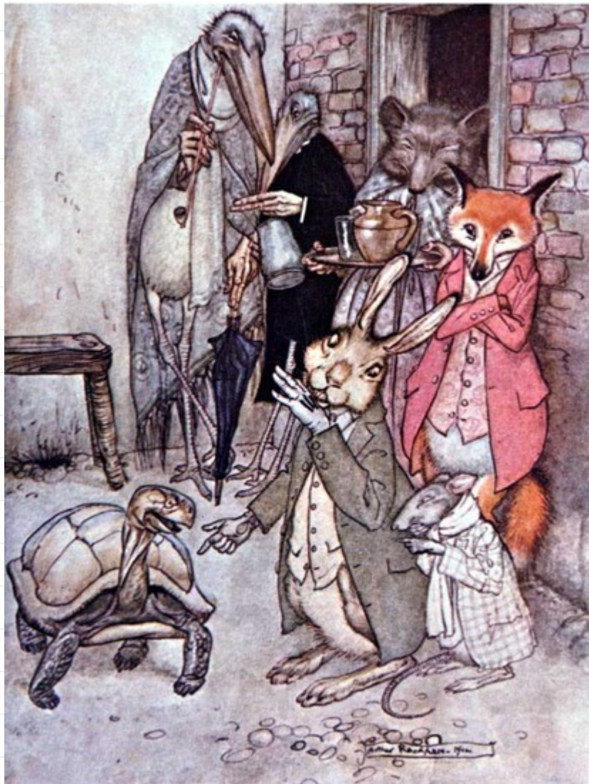
The Hare and the Tortoise illustration by Arthur Rackham