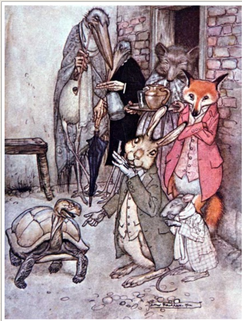
The Hare and the Tortoise illustration by Arthur Rackham