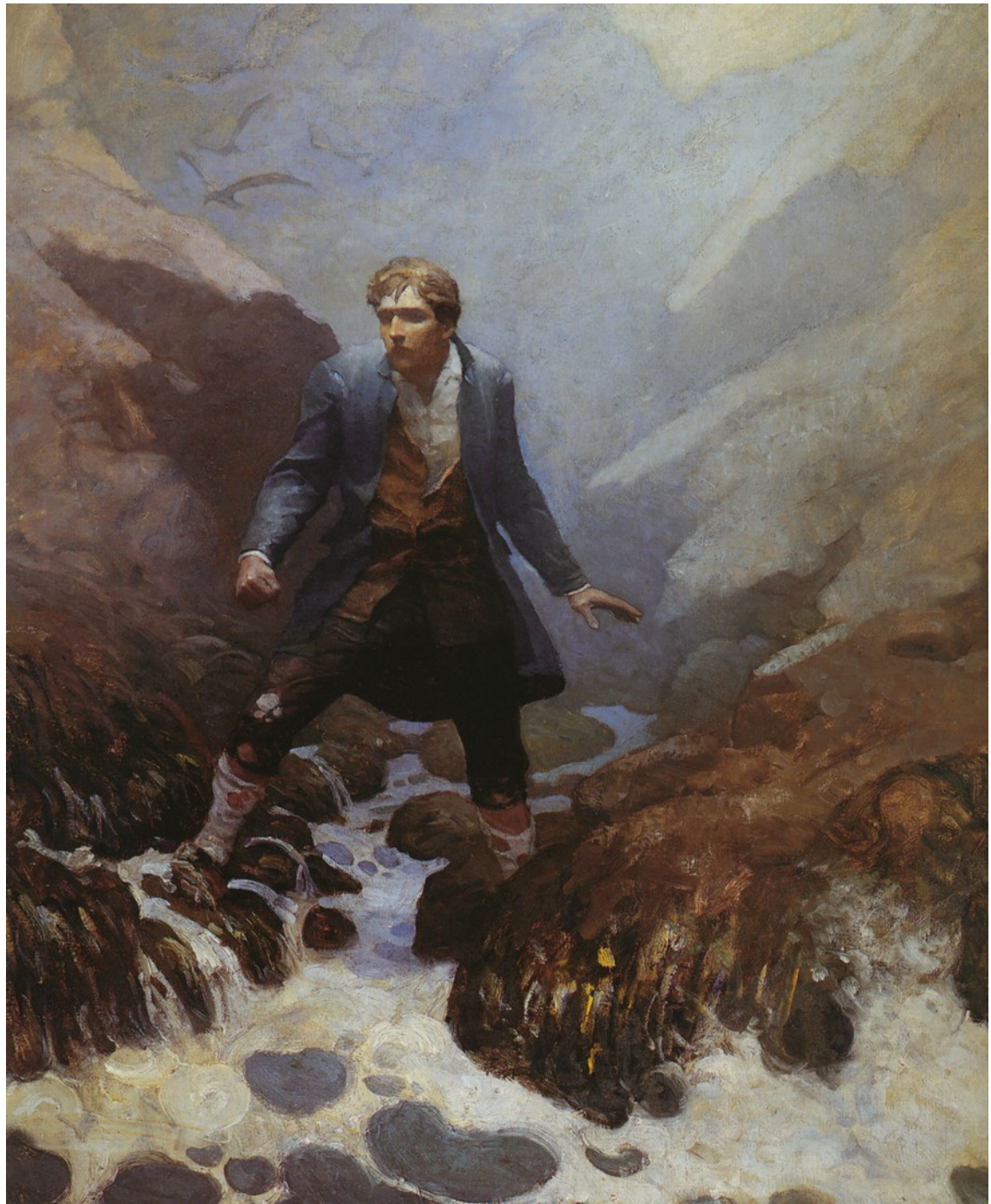
Kidnapped illustration by NC Wyeth