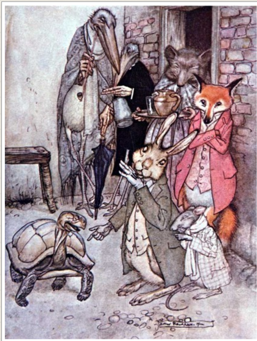
The Hare and the Tortoise illustration by Arthur Rackham