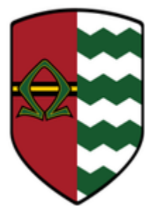
House of Omega