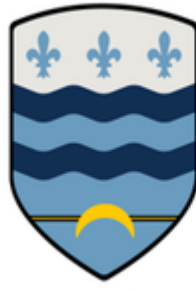
House of Blue