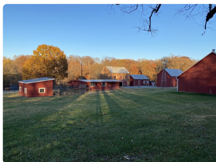
Oxon Hill Park