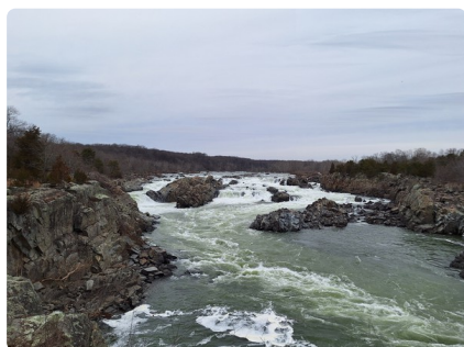
Great Falls Park