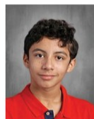
Dominic Paul VI Catholic High School