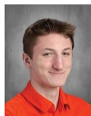
Warren American Leadership Academy