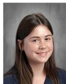
Ava Yorktown High School