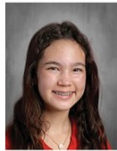
Samara St. Jerome Institute Northern Virginia