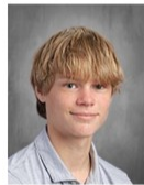
William Gonzaga College High School