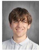
Steven Bishop O'Connell High School