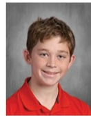
Logan Georgetown Preparatory School