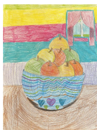
Artwork by Teagan King